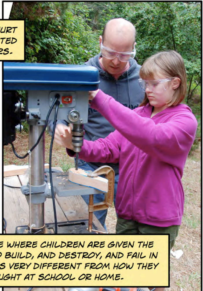
IT'S A PLACE WHERE CHILDREN ARE GIVEN THE FREEDOM TO BUILD, AND DESTROY, AND FAIL IN A WAY THAT IS VERY DIFFERENT FROM HOW THEY ARE NOW TAUGHT AT SCHOOL OR HOME.