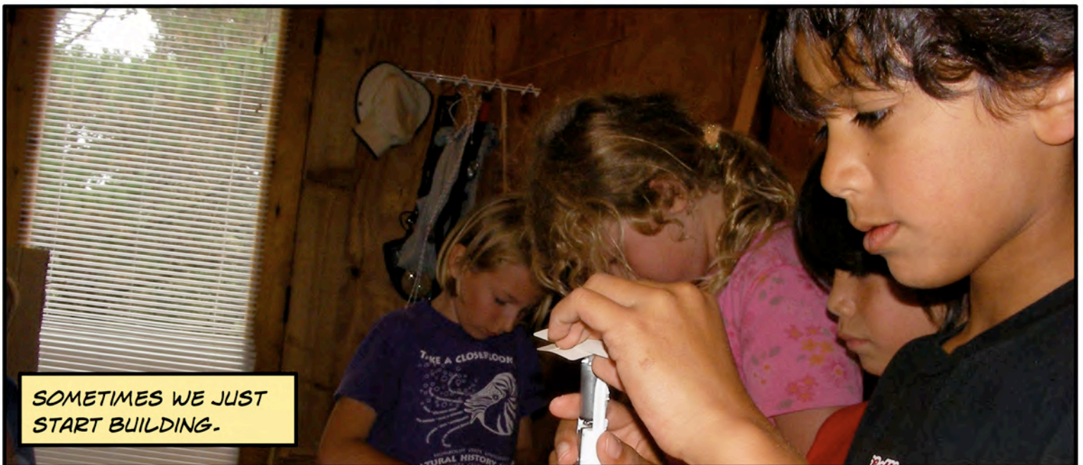
SOMETIMES WE JUST START BUILDING.