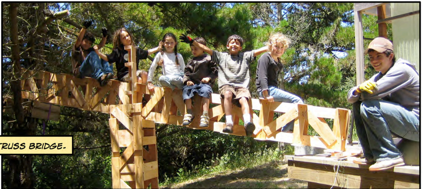
A TRUSS BRIDGE.