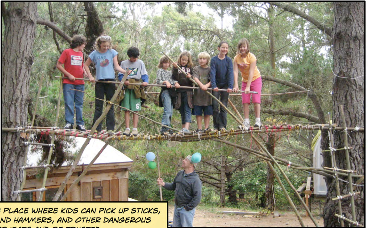
A PLACE WHERE KIDS CAN PICK UP STICKS, AND HAMMERS, AND OTHER DANGEROUS OBJECTS AND BE TRUSTED.