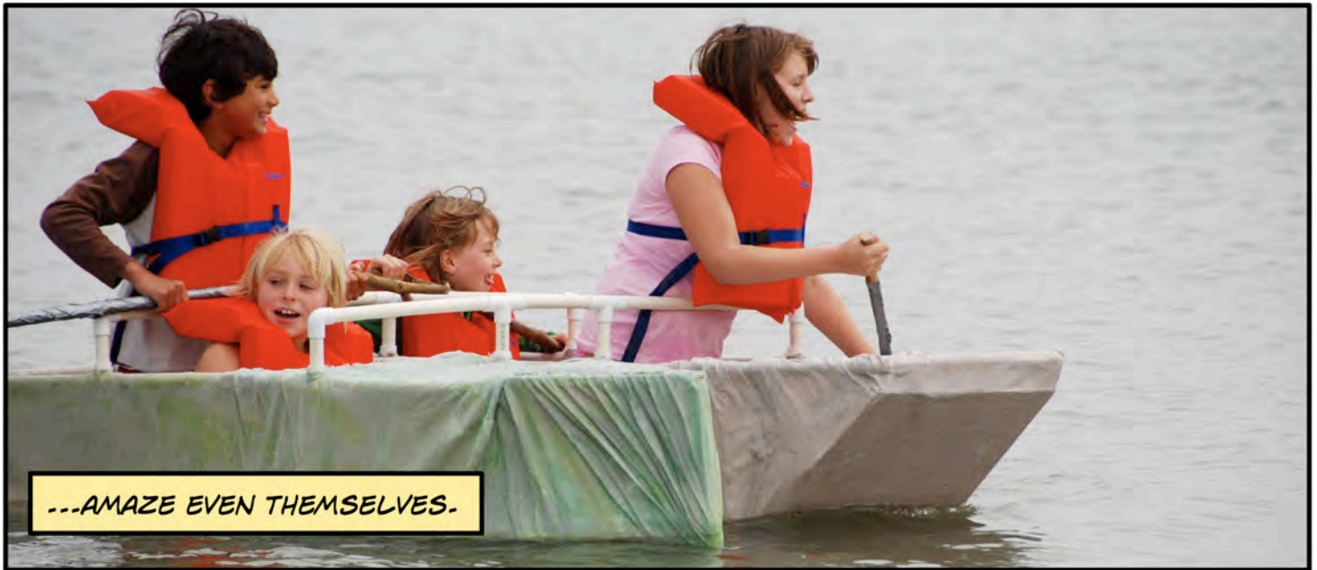
---AMAZE EVEN THEMSELVES.