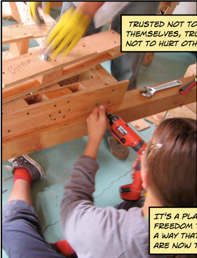
TRUSTED NOT TO HURT THEMSELVES, TRUSTED NOT TO HURT OTHERS.